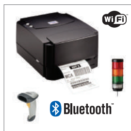
Wireless connection with peripherals