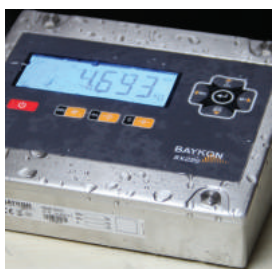
Various type of indicators