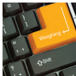
Data collecting software