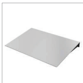
Ramps suitable for over surface usage